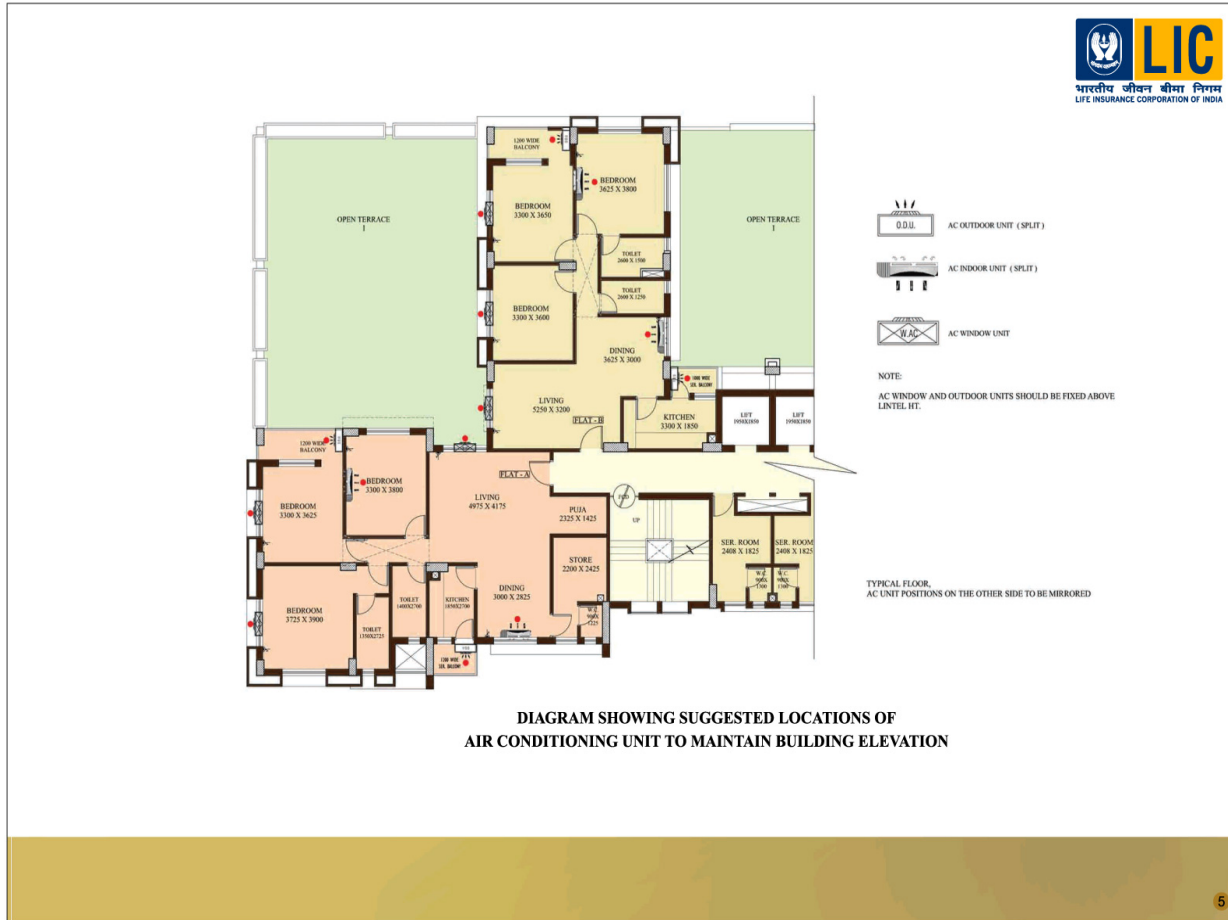
DIAGRAM SHOWING SUGGESTED LOCATIONS OF AIR CONDITIONING UNIT TO MAINTAIN BUILDING ELEVATION