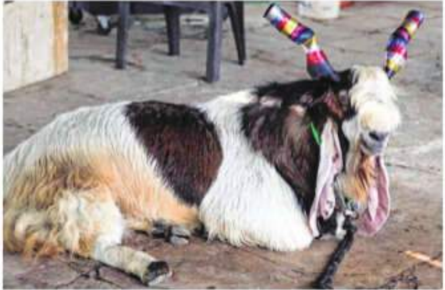
Mumbai - based man bought Kohinoor for Rs 16 lakh

Both of them, reared by the Nadeem Goat Farm, were purchased by a Mumbai busi-