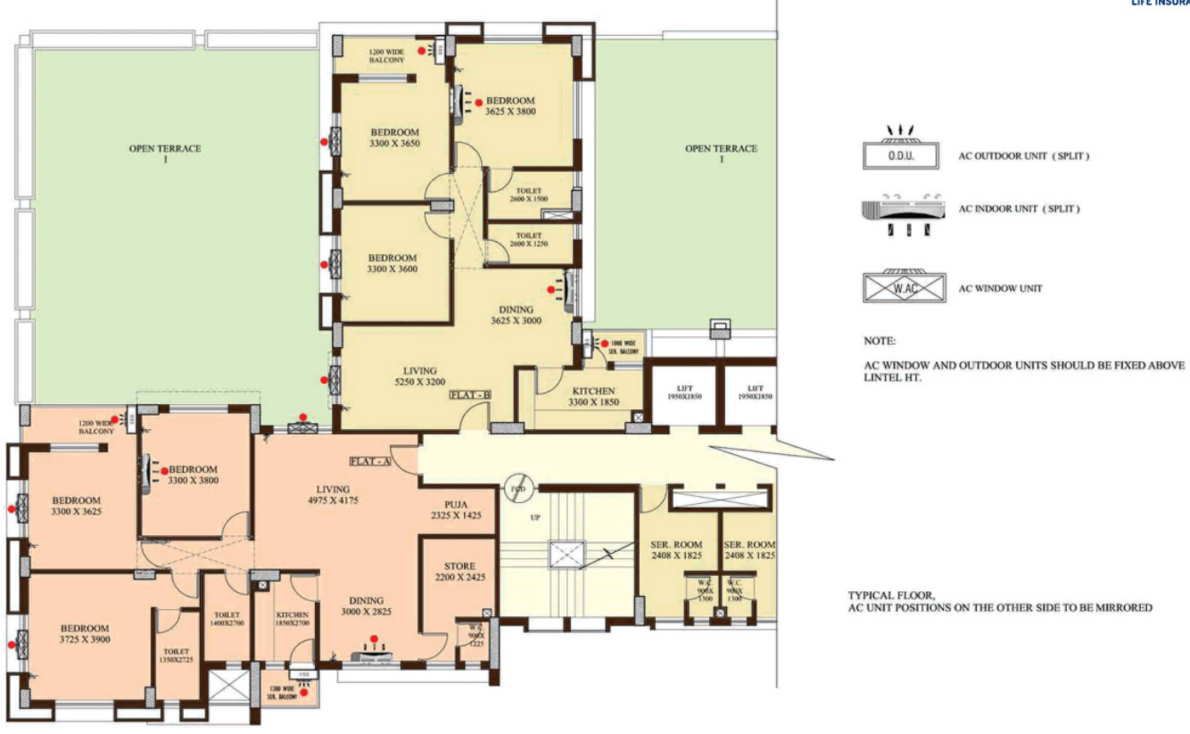
DIAGRAM SHOWING SUGGESTED LOCATIONS OF AIR CONDITIONING UNIT TO MAINTAIN BUILDING ELEVATION